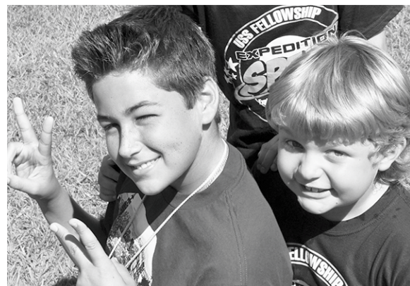
USS Fellowship cadets didn't let Wednesday's power failure stop them from having a great day exploring God's awesome universe. Training aboard their shuttlecraft, singing on the Main Bridge or playing on the realistic outdoor Holodeck — it was "ops normal."